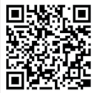
Aragon Reserve Woods