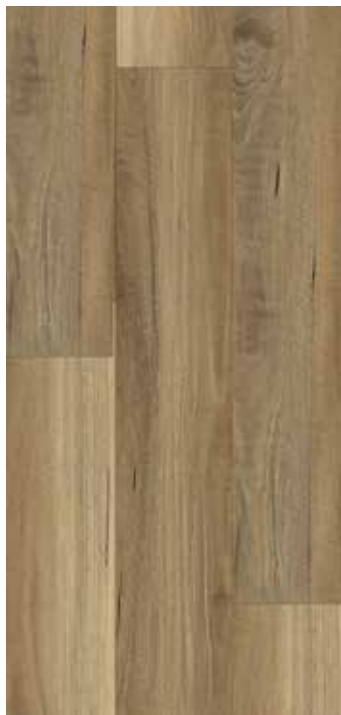
Australian Spotted Gum 6507AR