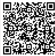
Hybrid Flooring Care & Maintenance

Flooring Distributors of Australia sales@fda.net.au www.fda.net.au