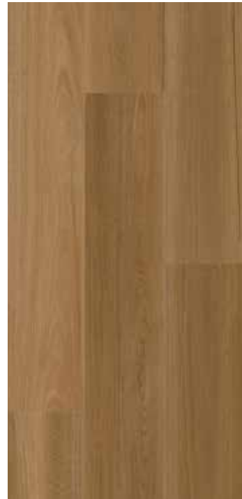
Majestic Natural Blackbutt 6570AR