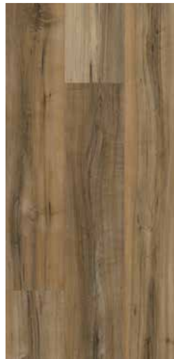
Southern Blue Gum 6506AR